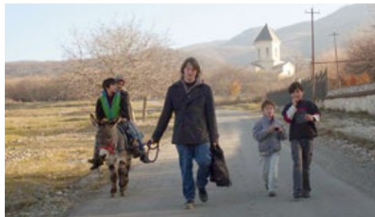
School Building and Children from the 'Education on the Periphery' Initiative in Saguramo