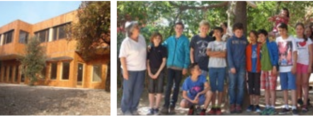
The new Upper-School Building; Students from Class Seven

Finally, after over seven years of hard work – an area near Barcelona, very much shaped by Catalonia identity – now has a Waldorf school which runs from kindergarten up into the upper-school level. El Til.ler roughly means 'the lime tree is growing'. And the tree really is growing into a society which until now didn't have much time for schools which aren't Catholic or run by the state. Yet the lime tree is putting down roots and stretching out its branches – and the children are delighted. At last – the school no longer stops at the end of class six! Some of those involved can remember the drama of the early years, when the children had to change over to the state system after class six, where the students have to cram for an unending series of tests. A system, in which 30% of students drop out without obtaining any school-leaving qualification.