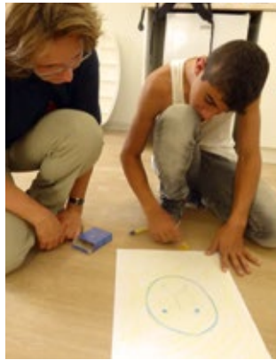
Above: Painting and Music Therapies at the Sentilj Refugee Camp, Slovenia.