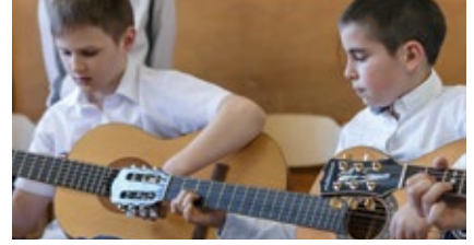
Children learning in schools supported by the International Aid Fund