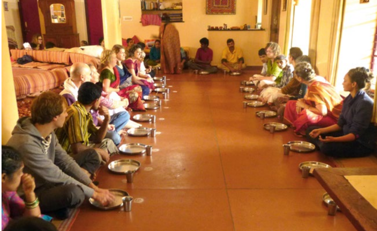
Music and celebratory feast as part of the festival of light, Diwali, at the 'Friends of Camphill' social-therapeutic institution. Below: cows on the streets of Bengaluru

that many festivals are celebrated together throughout the year.