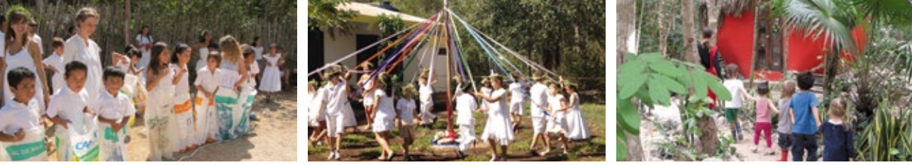
Impressions of Ak Lu'um

Playa del Carmen lies on the Mexican peninsula of Yucatán. People normally travel there to have a holiday on the white sandy beaches of the Riviera Maya, which stretch for miles. But if you were to follow a seemingly unspectacular sign with a tortoise on it at the end of the town for a mile or so, then you'd be in for a big surprise. On through wide cul-de-sacs, there to provide access for new building plots, you finally come, via ever-narrower tracks, to the Ak Lu'um Waldorf School in the middle of the jungle. Temperatures here often rise above the 30-degree mark with a similar level of humidity. If you're outside the wood and in the sun, this gets unbearable in the morning already, but here, in the middle of the lively and slightly moving shadows, a pleasant warmth prevails.