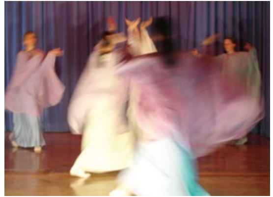
Budapest Eurythmy School

are asking questions about this education system, people, for example, who grew up in Germany but are now living in Mexico, but also people whose families come from these regions, and who wish to engage for a more globally open and freer future.