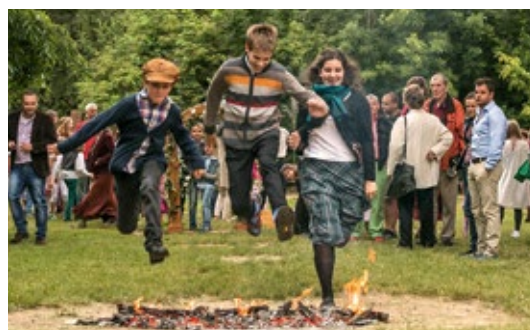
Godolló Waldorf School: Letters to the Education Sponsors; Children Playing; Jump over the Fire, during the Summer Festival

Twice a year, once shortly before Christmas and again in the summer, things become turbulent again for me, as this is when I organise the putting together and translations of the thank-you letters. The teachers write a report about each individual sponsored child and the children make things and draw with great enthusiasm for their sponsors. The positive responses from the sponsors, who are delighted to get the post and feel recognize, are a sign of how worthwhile this thanking task is. And often I get caught up myself in this correspondence.