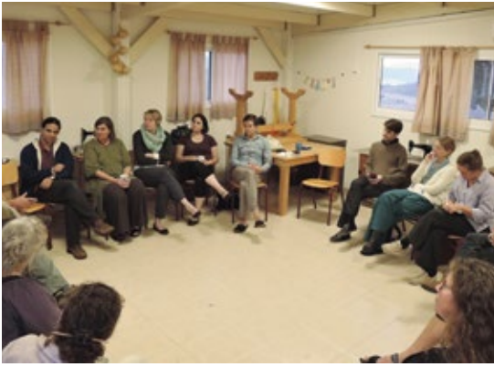
Staff Member of Friends of Waldorf Education in conversation with the College of Teachers at Yodfat School, Israel