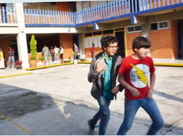
Left and Right: Students from the 'Escuela Waldorf de la Ciudad de Mexico'

Mexico is a country marked by contrasts. Particularly impressive are the prehistoric buildings and works of art left over from Mexico's great indigenous civilizations, including the legacies of the Mexica, Maya, Olmec and Zapotec tribes. Although Spanish has been the official state language since colonisation in the 16th century, 68 officially recognised indigenous languages survive in Mexico until this day - languages and not dialects, as some call them.