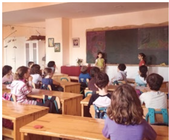
Left: Student painting at FISTA in Lebanon. Right: View of valley housing the Yodfat Waldorf School, Israel; Main Lesson in Caracol, Guatemala; Class 2 in the Tel Aviv Waldorf School, Israel