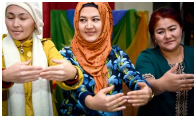
Left and right: Impressions from Graduation Ceremony of the Previous Course