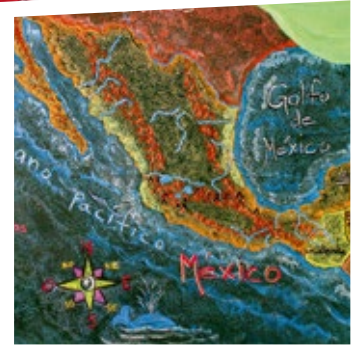
Impressions from Mexican Waldorf Schools

At school many children suffer from many of the same ailments and difficulties which are also to be found in other countries: deficiencies in quantity of sleep and in dietary terms, a lack of early years input, stress (albeit less than elsewhere), an unrythmical daily life, and movement and language disorders. Mexican families are very strong and loving communities and their children are most precious to them. In terms of classroom practice we observed that older children are often far too mothered at school. They aren't trusted with even the smallest of difficulties and hardly need to take on any responsibility. Their freedom is severely restricted by continuous admonishing to always be careful, clean and orderly. Anything which could potentially