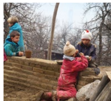
Students from the Cologne Waldorf School help in the kindergarten during their art trip; view of the valley; children playing