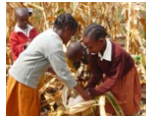
Steiner School Mbagathi: Final performance in the school hall; Painting in class 5; harvesting in the school garden

Danish and Swiss sponsors who pay the school fees for the families make the children's attendance at the school possible.