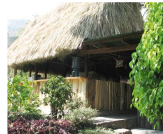
top left: view of Lake Atitlán, right: school building at Escuela Caracol

Actually, I could not believe that the construction of a new building with three classrooms would be possible on this steeply sloping property with volcanic stone blocks all over the place. Also there was only a single access from the village road, namely a narrow rocky path leading through shrubby undergrowth over a length of about 300 m. The use of heavy equipment would be unthinkable. When I arrived on a Sunday in November 2012 to initiate the beginning of construction, I had only one worry: how on earth would it be possible to build? But my worry proved pointless. The next day the construction workers walked up the path from the village, real Mayans, equipped with shovels, pickaxes, hammers and chisels. Soon enough they began crushing the stone blocks by hand, levelling the ground, and digging the foundations.