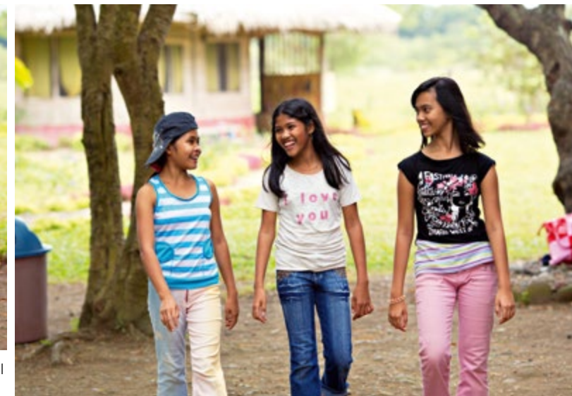
Over the past years the Gamot Cogon School Waldorf has received funds through the WOW-Day campaign.