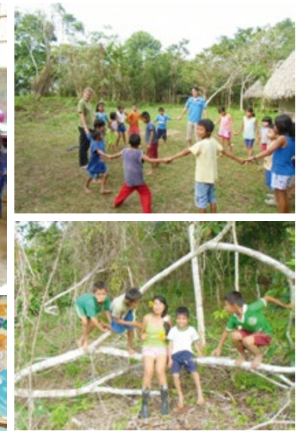
left: Waldorf educational social project in Sauce/Peru; right: the Shipibo village