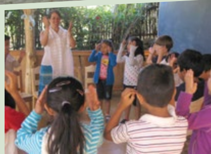
Escuela Caracol, San Marcos La Laguna / Guatemala