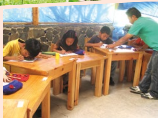
top left: Construction partially funded by the BMZ; top right: active school founders/teachers; middle/bottom: school life in unfinished classrooms