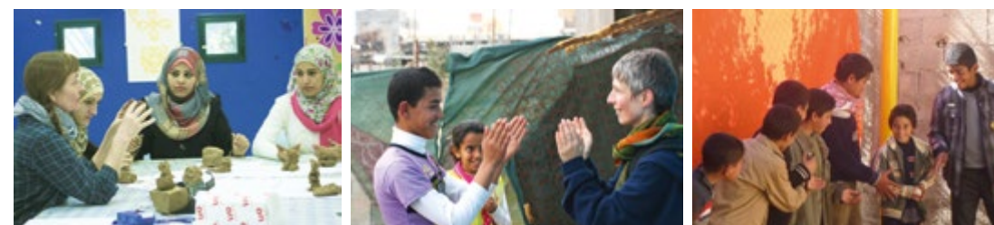
Clay modelling with staff members of the Al Qattan Centre; rhythm and coordination games with children

The military conflict in November 2012 makes the emergency education intervention at the Gaza Strip more important than ever, but at the same time the funding from the German Federal Foreign Office ended in February 2013.