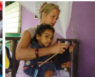
left: Educare Centres/South Africa, right: Sea Heart School/Costa Rica

Guatemala, Costa Rica, and the Dominican Republic. Currently, the Escuela Caracol in San Marcos La Laguna, Guatemala, is constructing a new school building with our help and co-financing by the German Federal Ministry for Economic Cooperation (BMZ). We have also supported the annual conference for Waldorf kindergarten teachers in Central America and local teacher training courses.