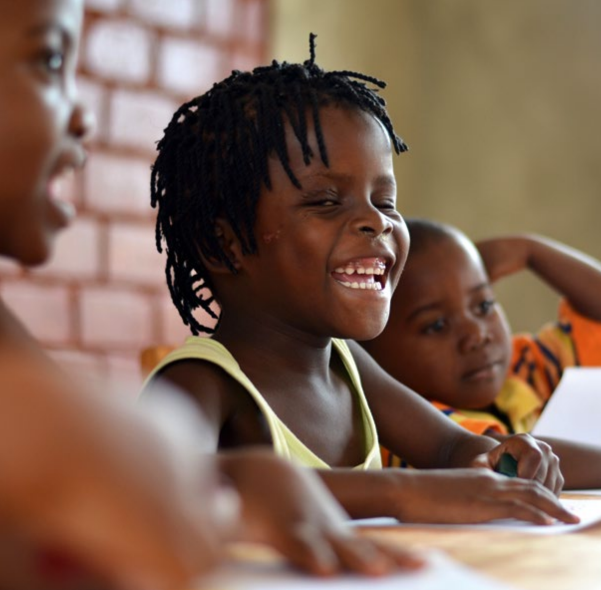
Hekima Waldorf School, Tanzania

More about the sponsorship program of the Friends of Waldorf Education at www.freunde-waldorf.de