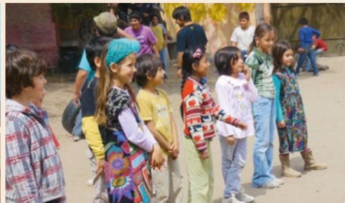
right: godchildren of sweet hope at the Colegio Miguel Angel in Cieneguilla (suburb of Lima); left: waldorf project Runayay in Lima in the district of Salamanca