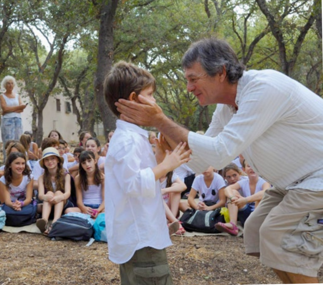
Waldorf School in Pardes Hannah Rimon/Israel