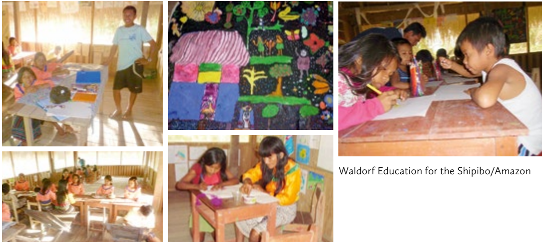
Waldorf Education for the Shipibo/Amazon