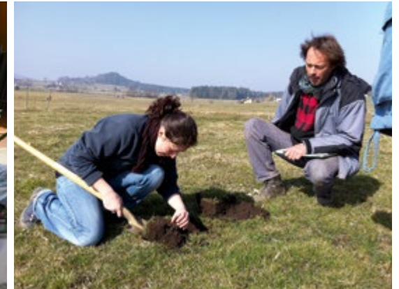
left: first Camphill in Asia: Peaceful Bamboo Family in Hue/Vietnam; right: the biodynamic ambassador of the Friends of Waldorf Education