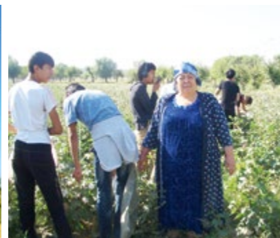
A regular school day in Khujand/Tajikistan: Waldorf education is not yet officially recognized by the authorities