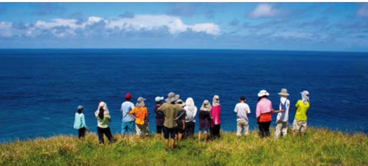
Students of Hai-Siann Waldorf school on a field trip in the surrounding area