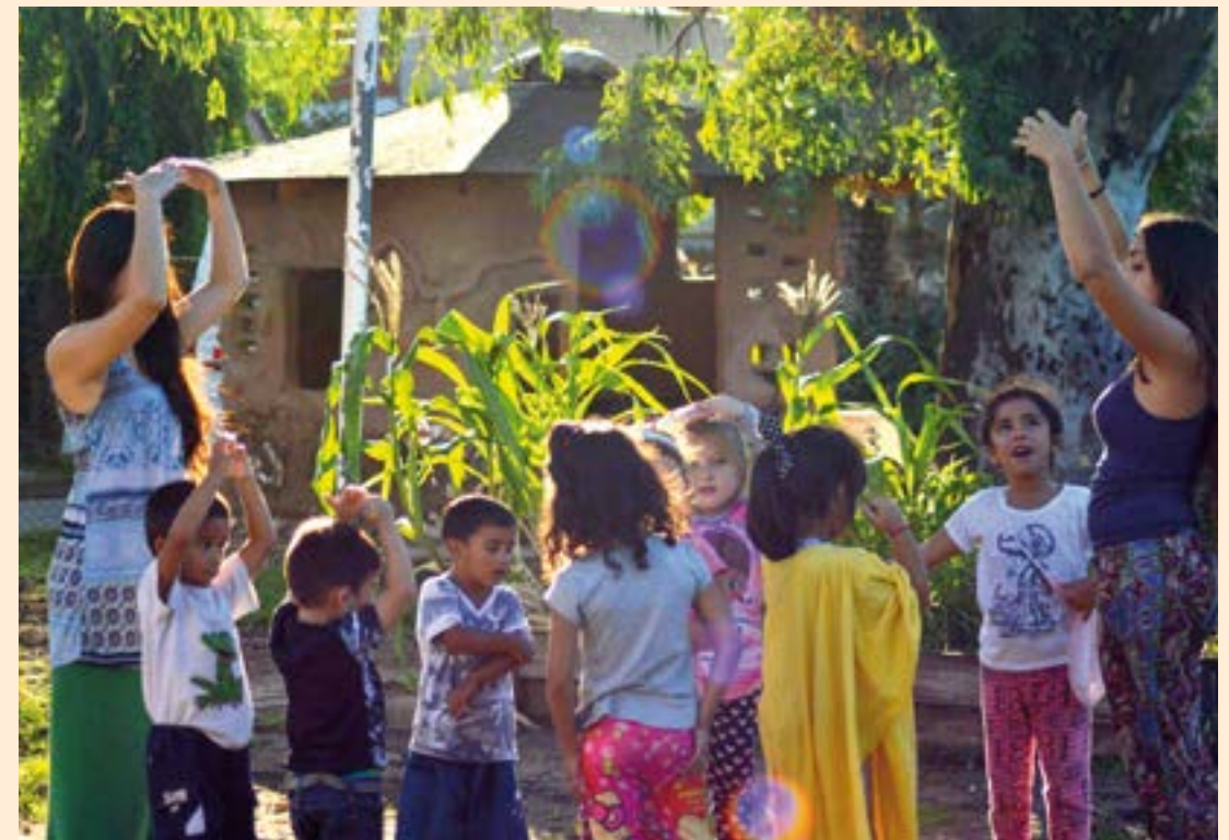
At Cultivarte children from disadvantaged families enjoy creative afternoon care and healthy food.