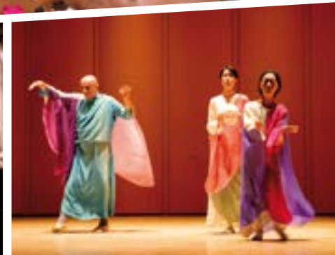
left side above: