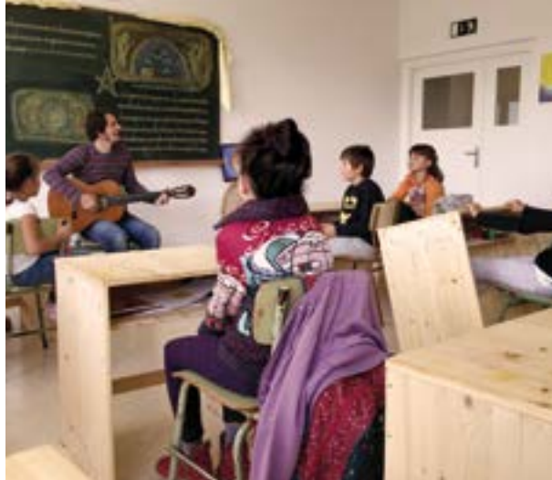
Music Class at the Basque Waldorf School in Vitoria-Gasteiz.

Last year was a special year for Emergency Pedagogy. For ten years now, the Friends have been committed to help traumatized children from war zones and disaster areas. The global increase of armed conflicts and natural disasters brings ever new chal-