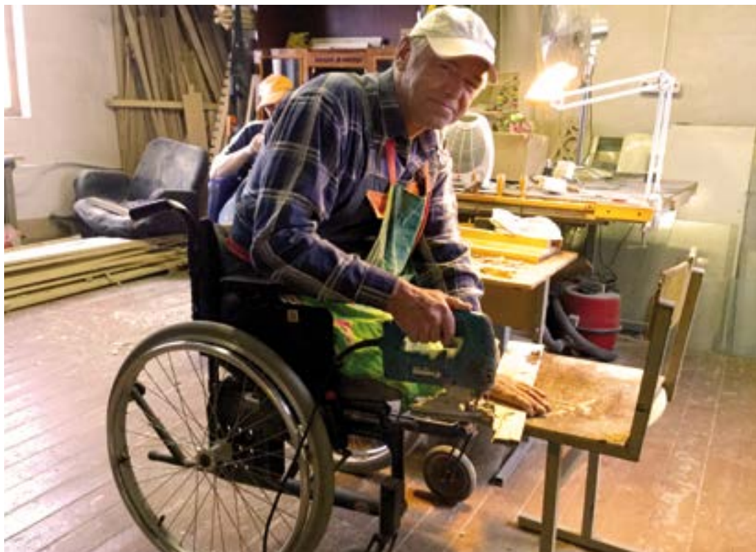
Views into the workshops of Blagoe Delo.