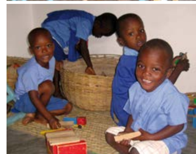
Children in the École du village , Haiti.